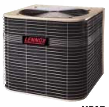
HP27 HEAT PUMP

We're proud of the fact that the HP27 heat pump has earned ENERGY STAR® qualification, which means it meets the EPA's standards for energy efficiency. This translates to year-round comfort and energy savings.